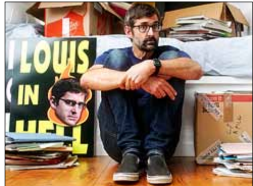
LOOKING BACK: Louis Theroux returns to TV this Sunday

● Louis Theroux: Life On The Edge starts on Sunday at 9pm on BBC Two.