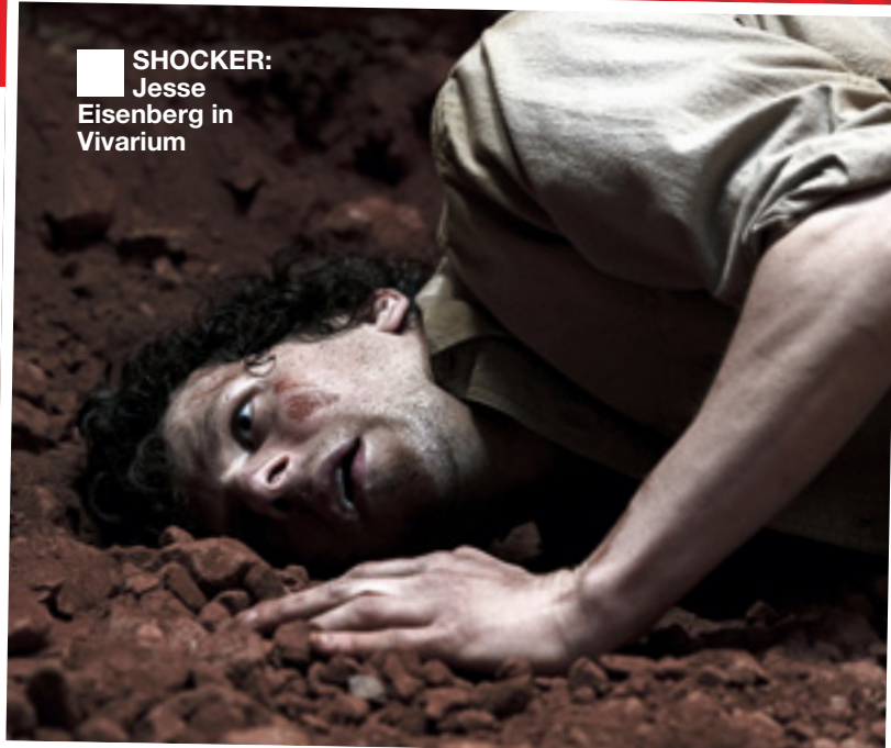
SHOCKER: Jesse Eisenberg in Vivarium

The winner also gets to sell their gear on an Amazon store. I can understand why they're as screamingly thrilled as the hosts. - MW